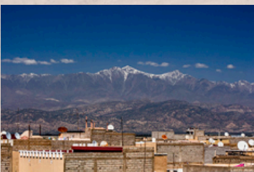
View of Atlas Mtns from La Maison Anglaise roof terrace, 2015

www.becomingClear.org/activities/morocco2017.php