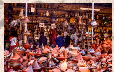
Tagine shop, in the Souk, Taroudant, 2015