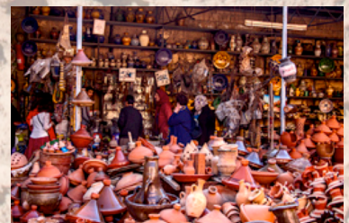
Tagine shop, in the Souk, Taroudant, 2015