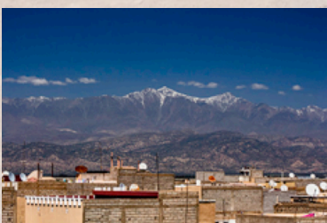
View of Atlas Mtns from La Maison Anglaise roof terrace, 2015

www.becomingClear.org/activities/morocco2017.php