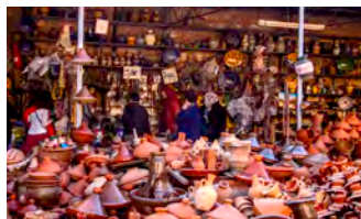
Shopping in the Souk, Mar 2015