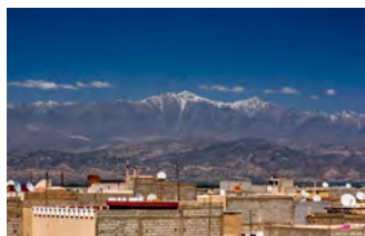
High Atlas Mtns, La MA Roof, Mar 2015