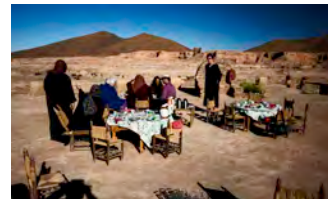
Desert Camp Breakfast, Mar 2015