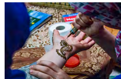
Berber henna tattoo, La Mason Anglaise, 2015