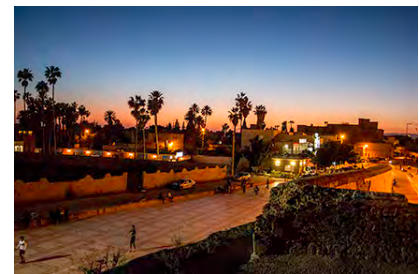
Sunset, from Taroudant city wall, 2015