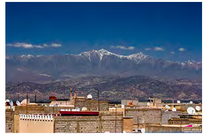
View of Atlas Mtns from La Maison Anglaise roof terrace, 2015