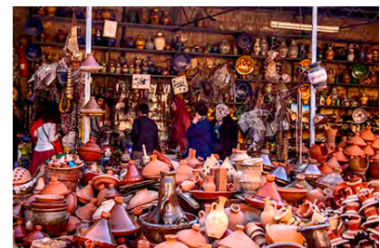
Tajine shop, in the Souk, Taroudant, 2015