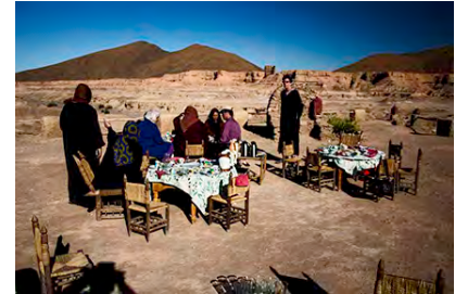
Breakfast at the Desert Camp, 2015